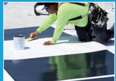
Clean & Prep Membrane Roof