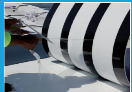
Peel & Stick Modules to Membrane