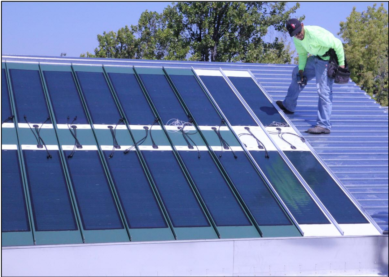
Figure 2 Miasole FLEX N on Standing Seam Metal Panels

While architectural standing seam panels are frequently used on carports, the 7.2 trapezoidal rib panel is the metal roof industry’s most commonly used corrugated roof panel for carports. Nearly every major metal roof and steel building manufacturer offers a 7.2 rib panel type profile.