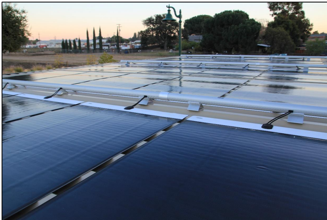
Figure 5 Completed Solar Carport with Wire Management