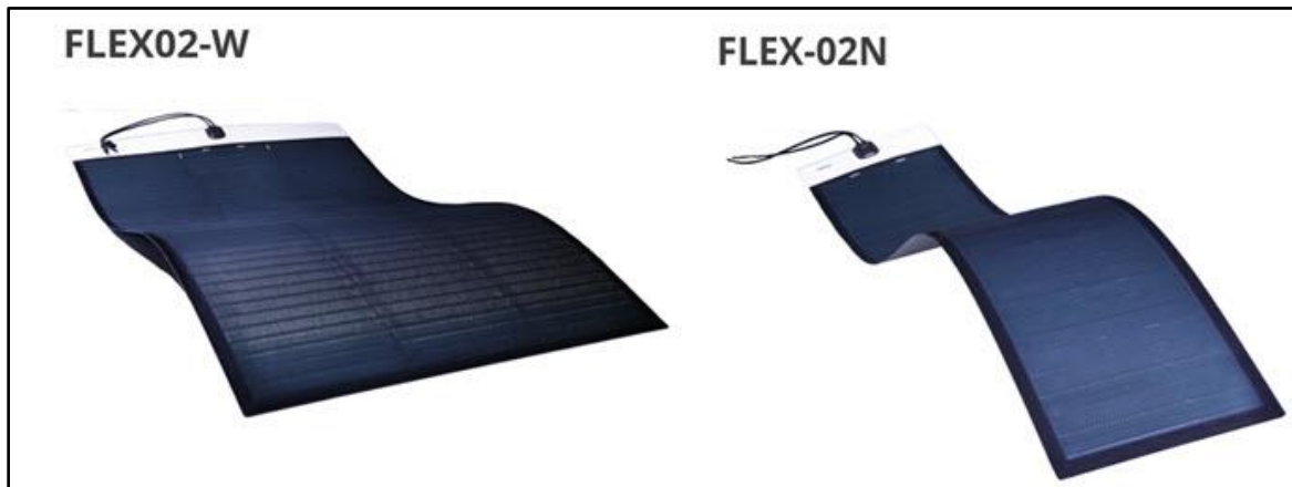
Figure 1 The Miasole FLEX Series PV Modules

the narrow format FLEX-N series designed for traditional architectural standing seam metal roof panels, and the wide format FLEX-W series. Both applied to the carport roof with a simple peel-n-stick adhesive.