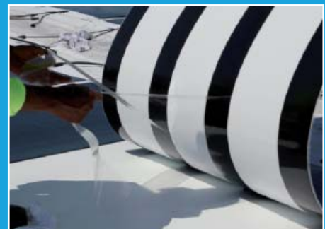
Peel & Stick Modules to Membrane