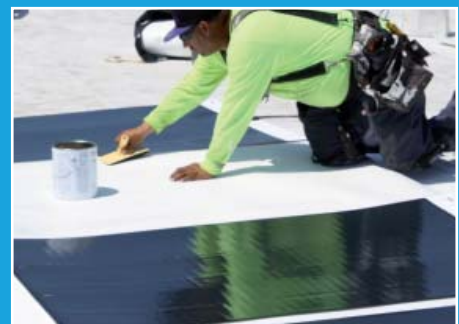
Clean & Prep Membrane Roof