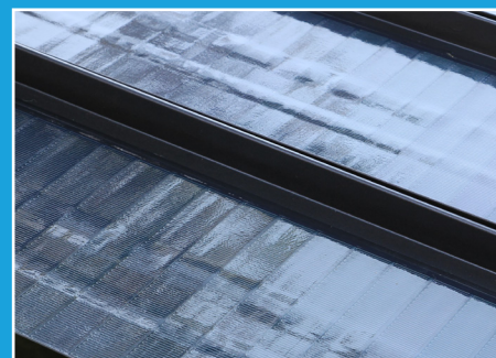
Steep-slope Standing Seam