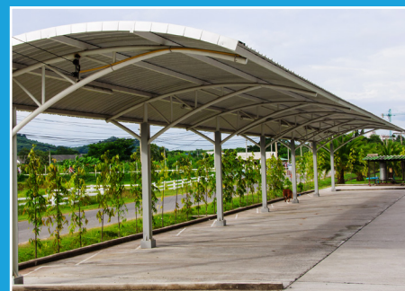
Solar Parking Canopies